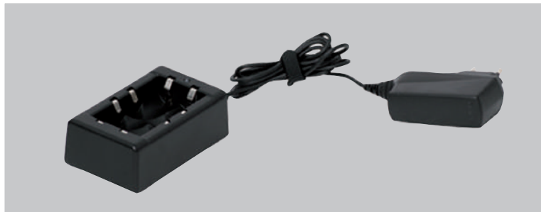
BATTERY CHARGER AND TRANSFORMER