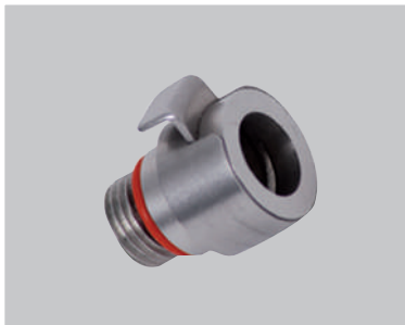
WOLF TYPE ADAPTER