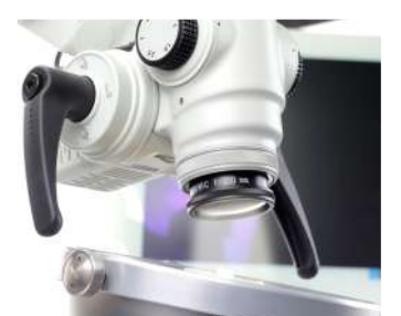
High power LED light