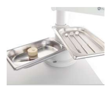
Instrument tray (Optional)