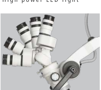
Inclinable binocular (optional)