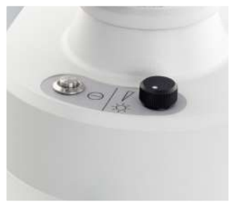
Light intensity adjustment