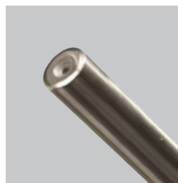
RESILIENT SAPPHIRE LENSES