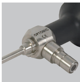
STAINLESS STEEL BODY